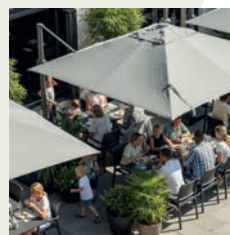
Parasols & Jumbrellas